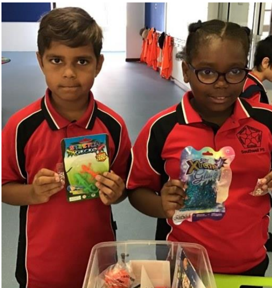
Positive Uniform Award winners

Let's keep everyone safe by showing respect, being responsible and striving to do our best.