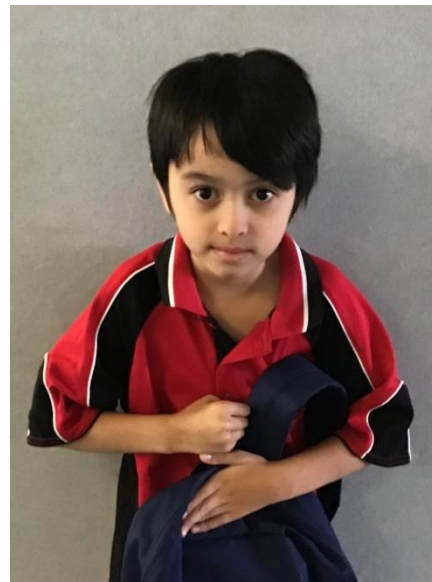
Positive Behaviour Award winner